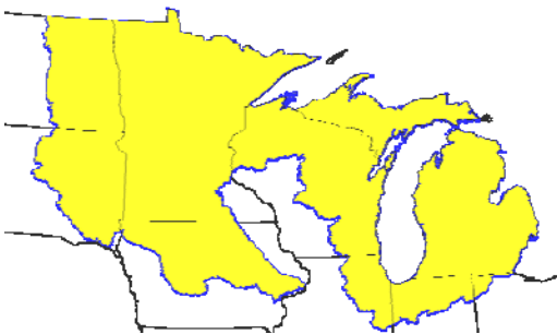
Area of Interest

The Midwest Glacial Lakes Partnership will release fish habitat assessments for Midwest lakes in October. The information will help those protecting and restoring lakes, ultimately leading to better fishing and improved water quality . Conservation funding through the National Fish Habitat Action Plan will focus on priority conservation areas identified in the assessment. This work is part of a larger project, conducted with Downstream Strategies L.L.C. and a diverse group of partners , to further aquatic habitat conservation for six fish habitat partnerships. The assessments add science and strategic direction to management decisions.