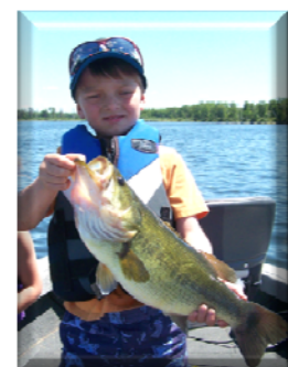
MORE BITES & SMILES

For information on the assessments, visit: